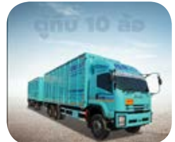
10 Wheels truck with closed-container

10 Moo 13 Tumbol Naiklongbangplakod Ampur Phrasamuthjedee Samuthprakarn 10290