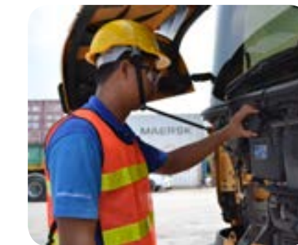
The radiator Check