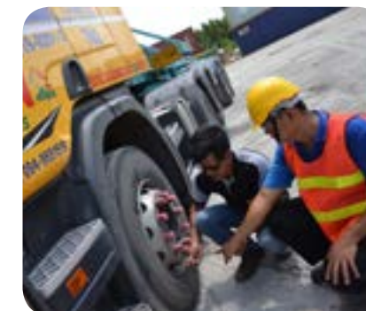
Tire pressure Check