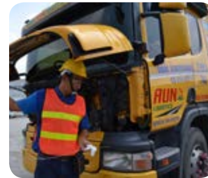
Engine oil Check