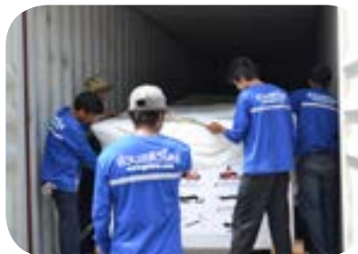
Products moving service